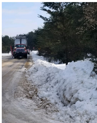
Before and After pictures of a tree trimmed right-of-way